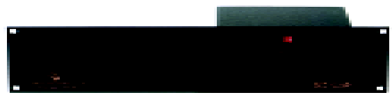
SAMLEX SEC-1223R1 DC POWER SUPPLY