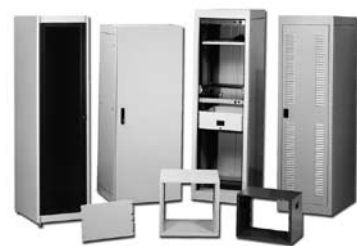
Racks & Rack Cabinets