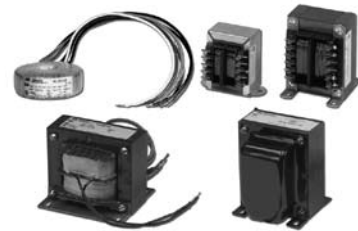
Transformers & Inductors